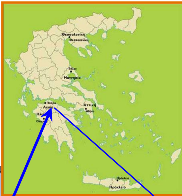
Map Below: The Region of Achaia

Area covered by the Agency: The whole Region of Achaia (21 Municipalities => Patras, Egira, Egio, Akrata, Aroania, Vrachneika, Diakopto, Dimi, Erineos, Kalavrita, Larissou, Lefkasio, Messatida, Momvri, Paos, Paralia, Rio, Sympolitia, Tritea, Farres, and Olenia, plus 2 Communities => Kaletzi and Leondio).